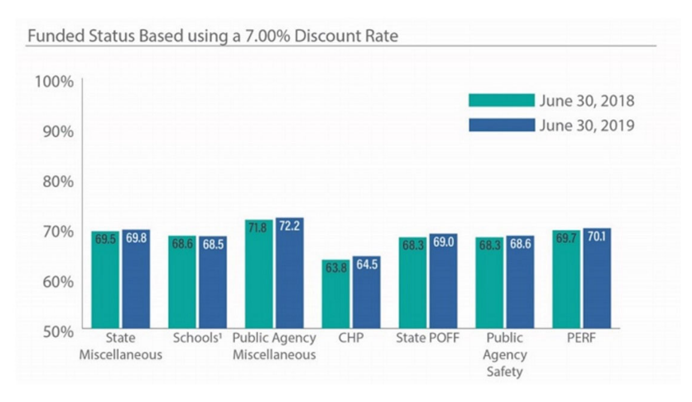
Source: Annual Review of Funding Levels and Risks Report (<u>Attachment 2</u>)

The impact of the pandemic stressed several key concerns, principal of which, is employers' ability to continue making required contributions while under financial strain. Other risks include meager investment returns of 4.7% in 2019–20, the impact of higher mortality rates (including more than 16,000 Californians to date), and increases in retirement rates. Employer financial pressures note increases in required employer contributions over the next several years, increased usage of pension obligation bonds, early retirement incentives, and furloughs. An increasing share of the newer members that are subject to the Public Employees' Pension Reform Act of 2013, will eventually put downward pressure on the risk measures in future years.