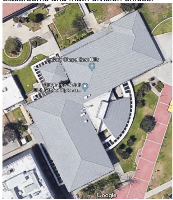
<u>Building H</u>: Three-story 97,521 GSF building housing the humanities, social sciences, language arts instruction, and humanities division offices.

Santiago Canyon College (8045 E. Chapman Ave. Orange CA. 92869) <u>Building D</u>: Two-story 42,136 GSF building housing the counseling center and offices, digital media lab, art labs, music and performing lab, speech forensics instruction, math classrooms and math division offices.