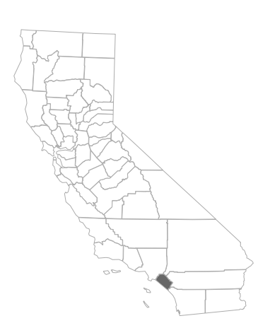
Orange County, California

Santiago Canyon College (SCC) creates a significant positive impact on the business community and generates a return on investment to its major stakeholder groups—students, taxpayers, and society. Using a two-pronged approach that involves an economic impact analysis and an investment analysis, this study calculates the benefits received by each of these groups. Results of the analysis reflect fiscal year (FY) 2020-21.